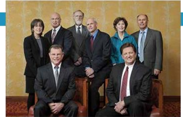
The Bevel, Gardner & Associates staff